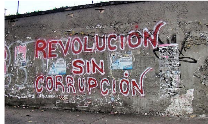
Graffiti by a disgruntled citizen