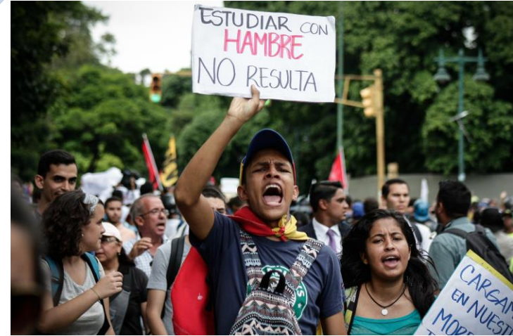
A protest about a shortage of food in Venezuela