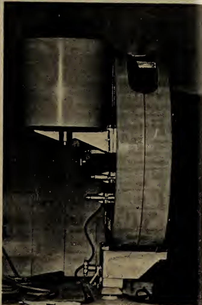
If you haven't been in the gym the past week you might be wondering what this is. If you thought it was a cement mixer you're wrong. It's a machine used to propel tennis balls at tennis players. The device was recently purchased by the athletic department for use by the C/D tennis team.