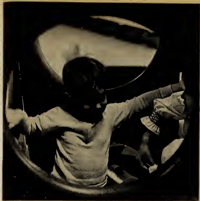
Will this young man remember the good old days? He is playing in a plastic cube in the Glenfield Baptist Church where the College of DuPage child development center is located.