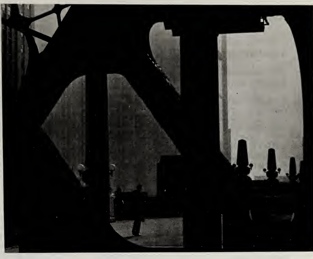
Daily News Portico — Chicago, Il. 1982